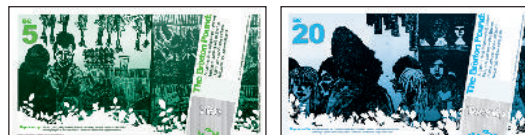
Reverse of notes