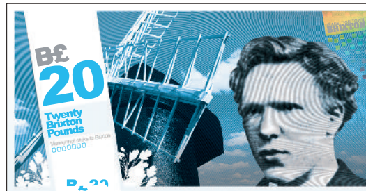
B£20 with Vincent Van Gogh